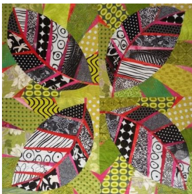
The Big Leaf on Saturday, April 29 th