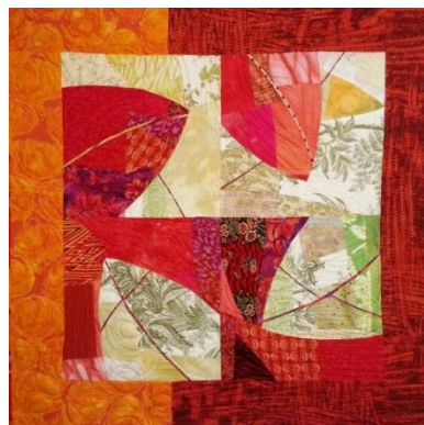
The Skinny Leaf on Sunday, May 1 st

As a heads-up, the program for the May guild meeting, on May 18 th , will be a garage sale for all guild members. This sale will provide an opportunity for members to sell (or purchase) gently used quilting-related items no longer needed by the owner.