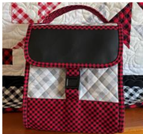
By Annie's Pattern - Grab Some Grub 2.0