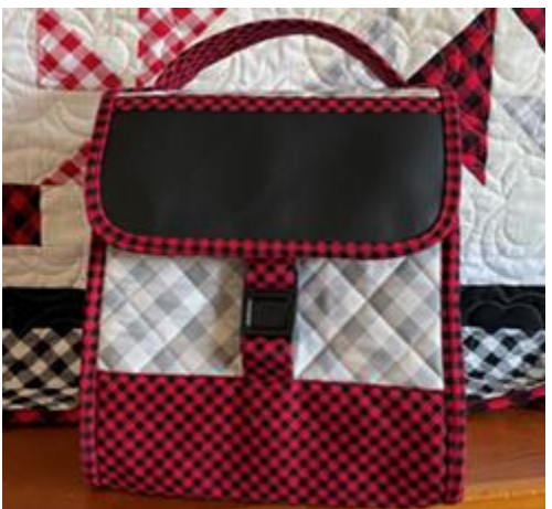
By Annie's Pattern - Grab Some Grub 2.0 Size: 9"H x 8"W x 6"D

Penny LaRochelle is the coordinator for the guild's 2023 Raffle Quilt. She is prepping kits for the quilt blocks for guild members to make. She will have the block kits available in the near future.