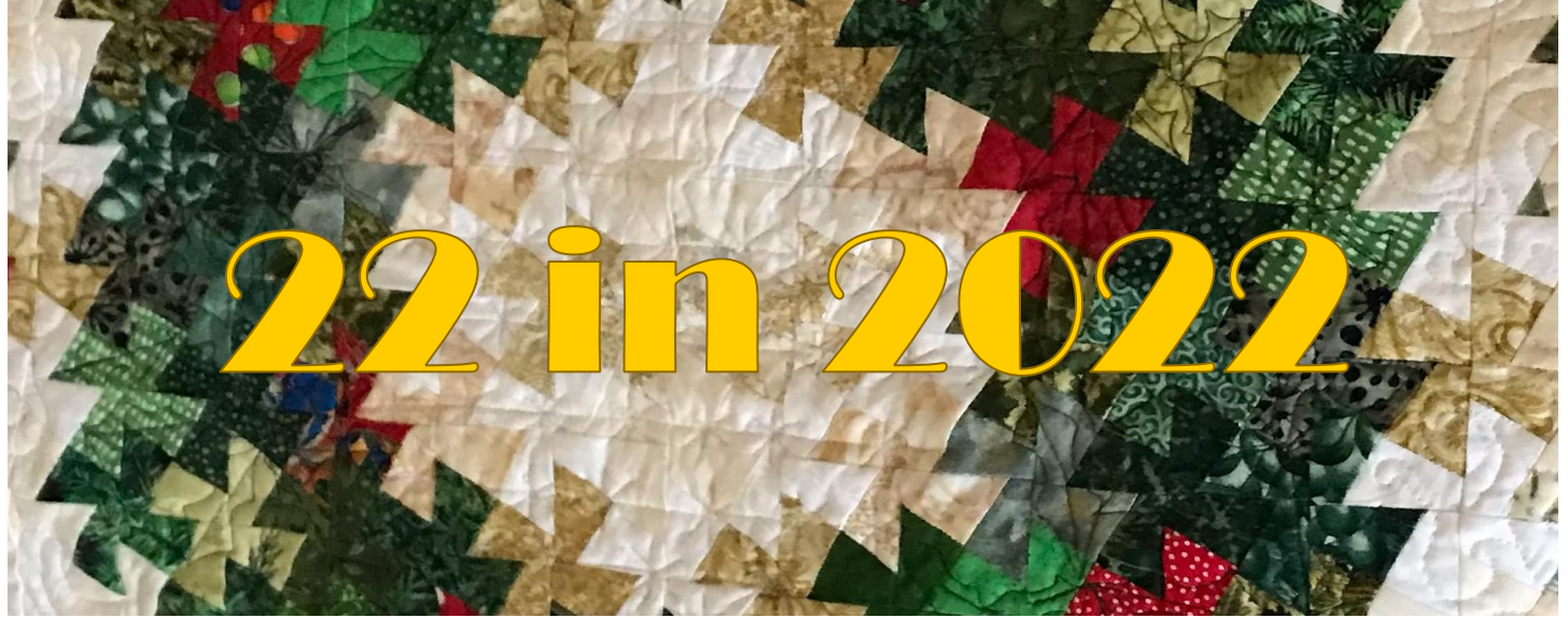
That is 22 Finishes in 2022:

Join in the fun and make 22 quilted projects by the end of 2022 and your name will be entered into a special drawing held in December 2022. If you'd like to participate, fill in your name and 22 projects you'd like to finish this year on the list below. This is your list...you can add to it throughout the year if need be to have 22 projects or you can remove a project, or swap out projects, etc...you just have to have 22 Finishes in 2022 <u>AND</u> you must send a picture of each project for one of the guild's monthly show and tell on Zoom. You can show multiple projects in one month. You also don't have to show a project every month, you just have to have 22 Finishes in 2022 ? You will maintain your own list, but you must let Sharon Perry know you are participating.