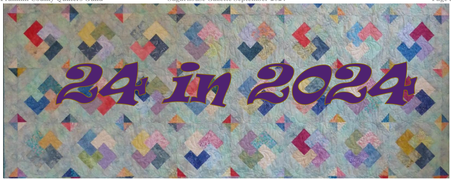
That is 24 Finishes in 2024!

Join in the fun and make 24 quilted projects by the end of 2024 and your name will be entered into a special drawing held in December 2024. If you'd like to participate, fill in your name and 24 projects you'd like to finish this year on the list below. This is your list...you can add to it throughout the year if need be to have 24 projects or you can remove a project, or swap out projects, etc...you just have to have 24 Finishes in 2024 AND you must show each project at one of the guild's monthly show and tell. You can show multiple projects in one month. You also don't have to show a project every month, you just have to have 24 Finishes in 2024! You will maintain your own list, but you must let Sharon Perry know you are participating.