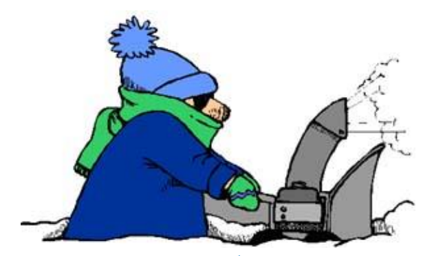
Let it snow, let it snow, let it snow!!!

Patterns for the block can be found on the FCQG Sugarhouse Club Facebook page. The patterns will also be emailed to members each month. The colors for the mystery quilt are primary colors. Some local quilt shops have packaged bundles of primary colors together for the guild's mystery quilt.