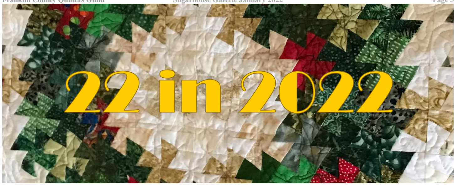
That is 22 Finishes in 2022!

Join in the fun and make 22 quilted projects by the end of 2022 and your name will be entered into a special drawing held in December 2022. If you'd like to participate, fill in your name and 22 projects you'd like to finish this year on the list below. This is your list...you can add to it throughout the year if need be to have 22 projects or you can remove a project, or swap out projects, etc...you just have to have 22 Finishes in 2022 AND you must send a picture of each project for one of the guild's monthly show and tell on Zoom. You can show multiple projects in one month. You also don't have to show a project every month, you just have to have 22 Finishes in 2022! You will maintain your own list, but you must let Sharon Perry know you are participating.