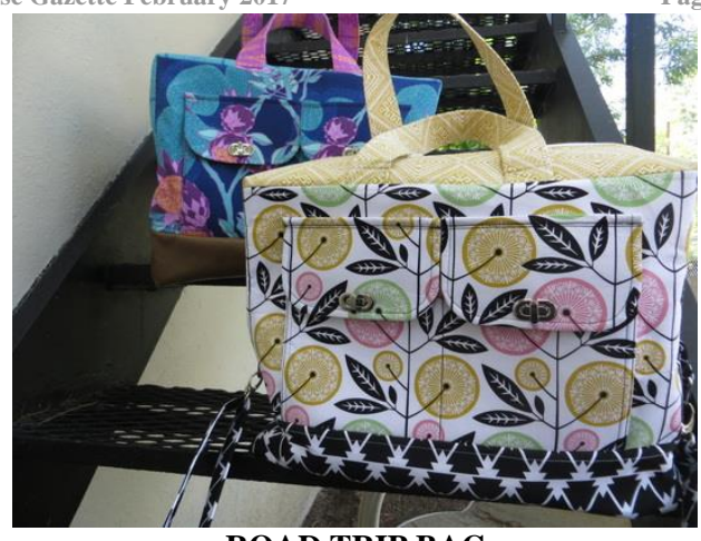
ROAD TRIP BAG