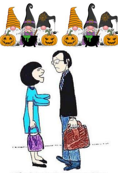
YES, I DID HAVE MY MAMMOGRAM TODAY ... WHY DO YOU ASK?